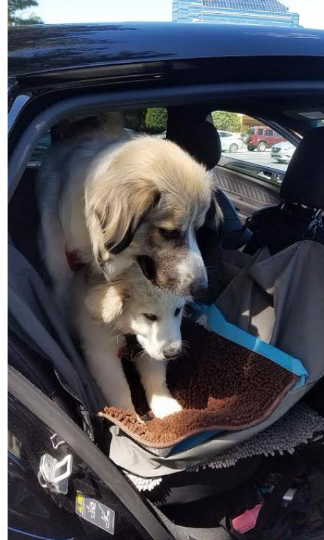
Got you covered

I wanted to share some feedback on our article from our March newsletter on harnesses and leashes. One of our readers recommended one additional harness, the Gentle Leader. She