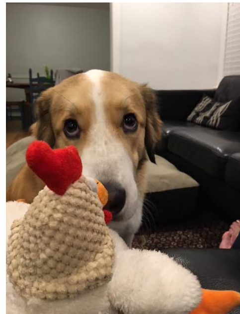
How about a real chicken?