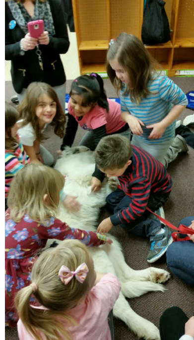
A Pyr's Heaven

If you think I would be the perfect addition to your home, please contact GPRA today to find out more about me.