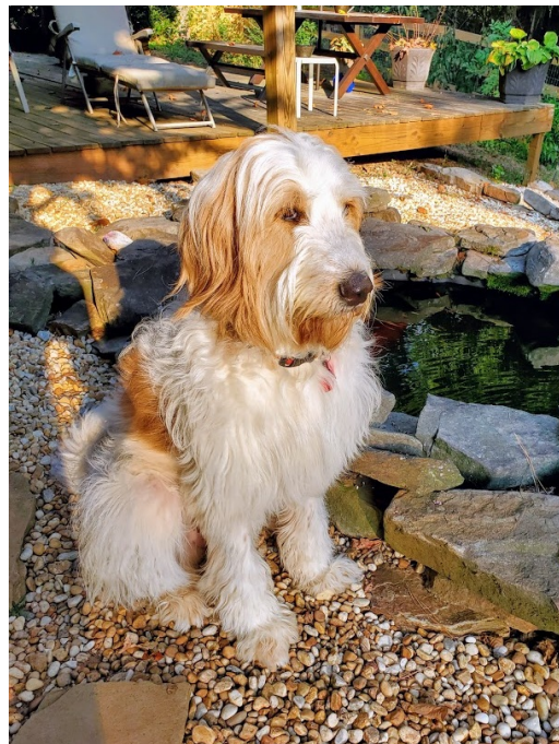
Saffy (formally Avett)